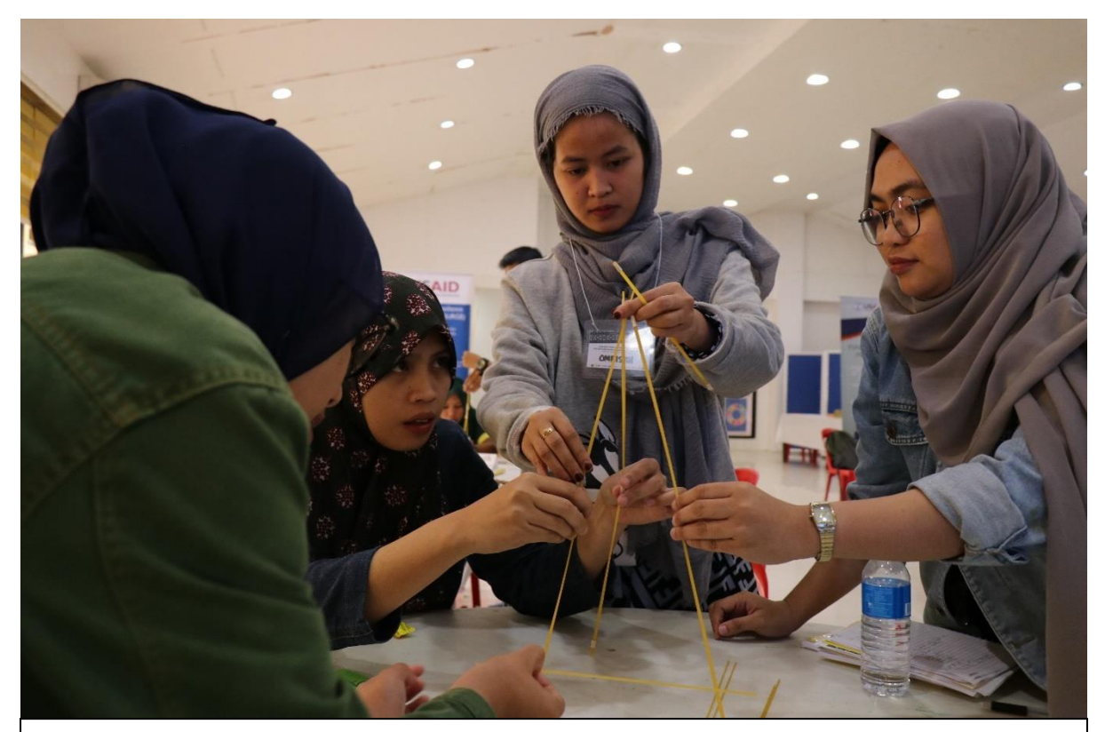
Youth innovators understand the importance of teamwork and creativity during one of PDRF's workshops.

PDRF and its partners continue to support communities in Marawi City. The diversity and type of their interventions is a testament to how the private sector, through collective action, can support internally displaced communities in a way that truly recognizes local dynamics.