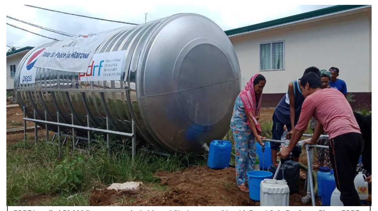
PDRF installed 50,000-liter water tanks in Marawi City in partnership with Pepsi-Cola Products.

PDRF served as a focal point, bringing together different stakeholders and leading the implementation of six different projects in Marawi City. While many interventions were carried out immediately following the conflict, PDRF's commitment to support recovery efforts in the area has continued until today.