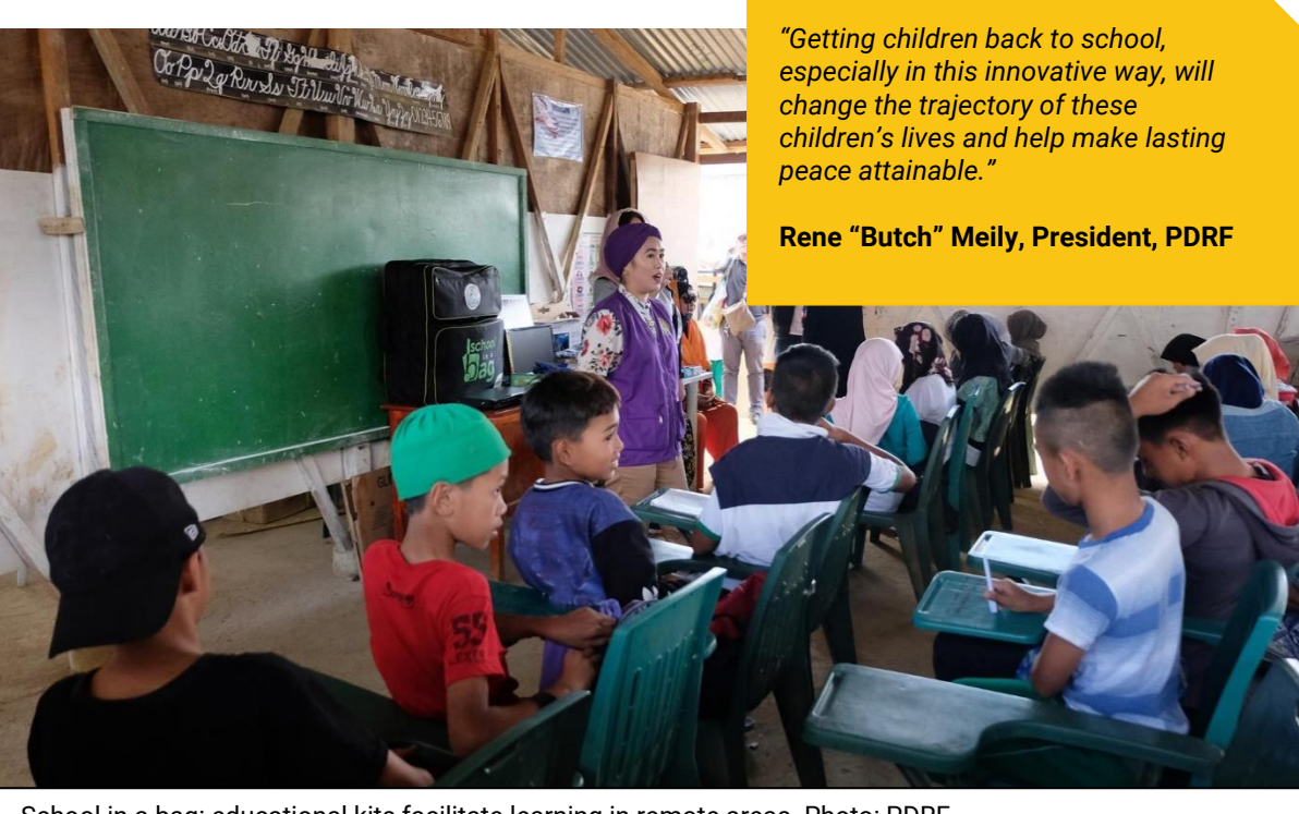
School in a bag: educational kits facilitate learning in remote areas.

In 2018, an estimated 86,772 school children were displaced due to school closures. To address the situation, PDRF provided educational support kits in Marawi City with the support of Project Handclasp Foundation (PHF) and the US-Philippines Society (USPS). PDRF interviewed school leaders and the superintendent of the Department of Education to learn that most students were afraid of returning to school, while others attended school in transitional or temporary learning centers. Selecting evacuation centers and certain elementary schools as the sites for the intervention therefore enabled the partners to reach a more children. The elementary school kit known as the "School-in-a-Bag" was designed by Smart Communications as a multilingual portable digital classroom facilitating learning in remote areas facing electricity shortages.