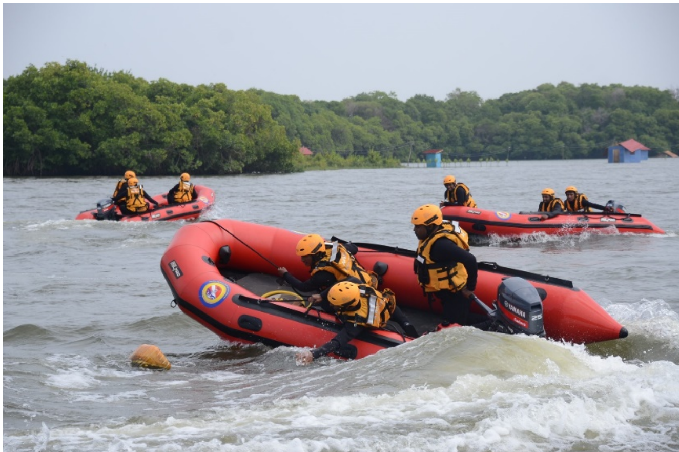
A-PAD Sri Lanka has organized Search and Rescue training sessions in swift waters.

For example, during the floods in June 2021, A-PAD SL, in partnership with a private sector member company, provided 3000 warm meals for flood victims through the “ Meals that Heal ” initiative. A-PAD SL also coordinated with the Disaster Management Centre (DMC) to ensure that the meals could be delivered safely during the COVID-19 lockdown.