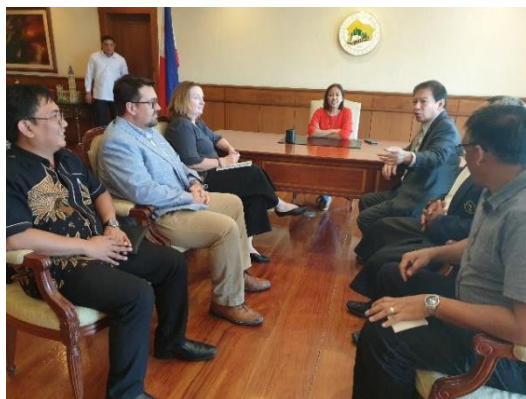
Fig. 8: Courtesy call with the Mayor of Makati

At the local level, Makati City Mayor Abigail Binay and city officials presented Makati’s programs for disaster management and how the city works with the private sector through effective risk assessment, education, and scenario-based planning at the city and community levels. Liza Ramos of Makati City underlined that PDRF is a formal member of the Makati City Disaster Risk Reduction and Management Council and that they have completed a community 3D mapping project in one of the barangays (communities) of the city (See Annex 2 for video of the mapping project).