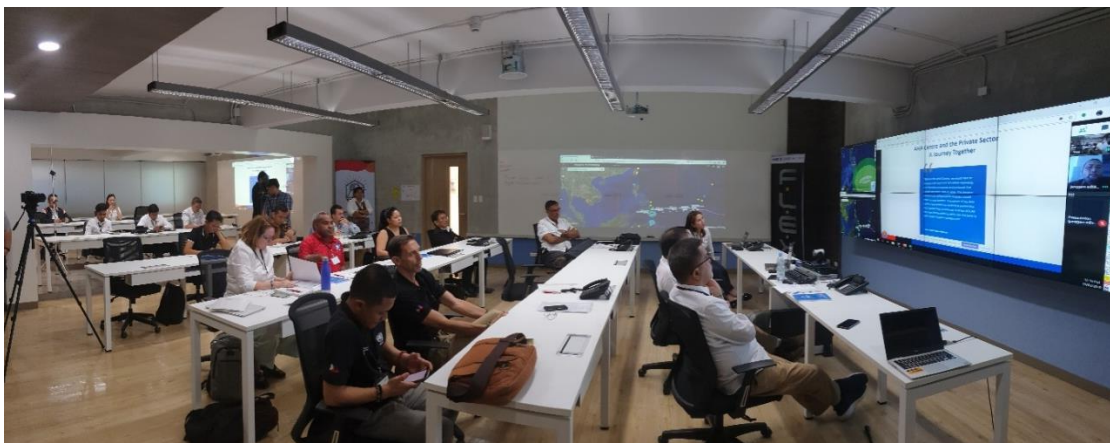
Fig. 6: Coordination call with AHA Centre from Jakarta, Indonesia

With the support of PDRF and other private sector bodies, AHA Centre aims to implement exchanges and knowledge sharing activities that will be mutually reliant on regional and private sector assets and expertise, in order to increase and boost the capacity and capability in responding to disaster.