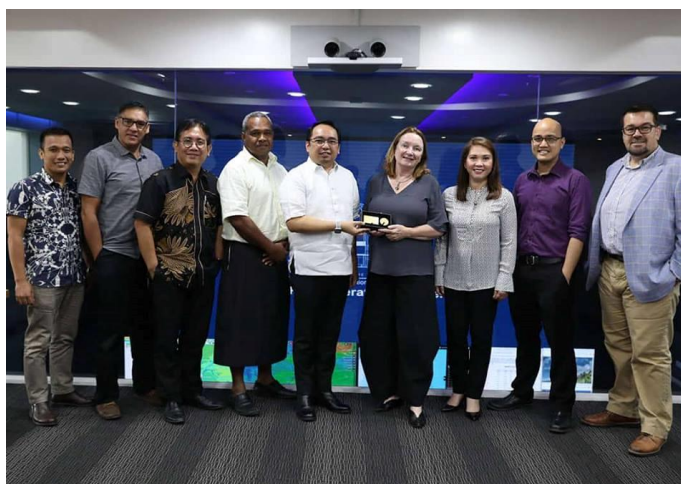
Fig. 7: Participants visit NDRRMC EOC in Manila