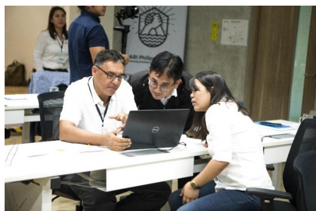
Fig. 4: Participants take part in the simulation exercise on earthquake response

The CBI network in the Philippines showcased various innovation products and approaches, particularly its Handa Platform, an ArcGIS-based Disaster Information Management (DIM) system that integrates reliable, accurate, and timely information on disaster management. The participants conducted an earthquake response simulation exercise for the anticipated M 7.2 earthquake in Metro Manila using the Handa platform and various facilities of the EOC.